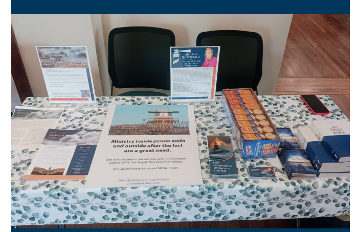
RE-ENTRY RESOURCE FAIR